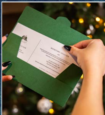
MONETARY VOUCHER FROM £5