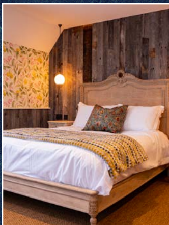
SLEEPOVER CLUB FROM £100