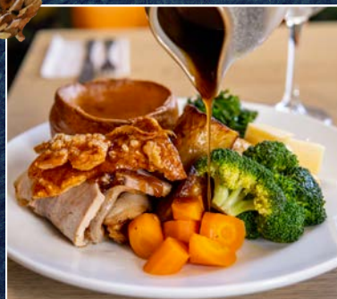
SUNDAY ROAST FOR 2 FROM £50