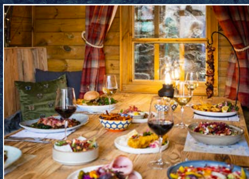
ULTIMATE SHACK EXPERIENCE FROM £35