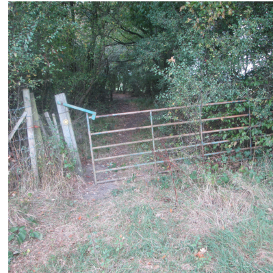
3. The gate onto the byway