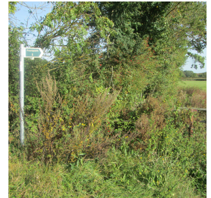
6. Out on to Standard Lane