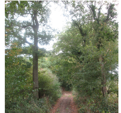
4. On Gadsby Lane