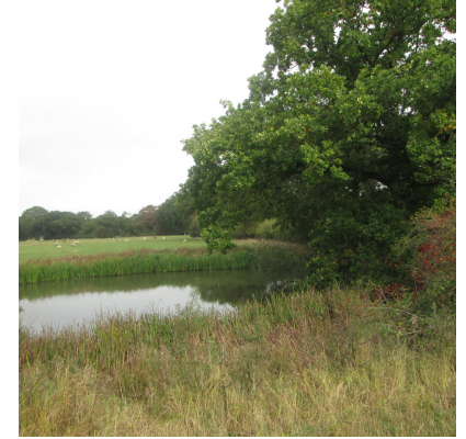
2. The pond in the field