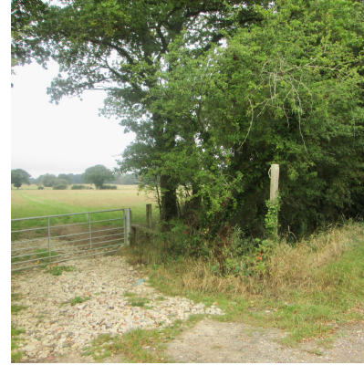
1. The footpath from Green Lane

www.elitepubs.com/venue/the-pig-and-sty/ hello@thepigandsty.com 01233 528 144