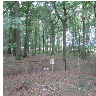
5. The gate into the woods