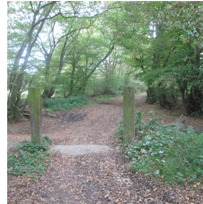
3. The posts onto Gadsby lane