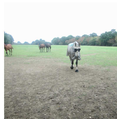
5. Horses in the fields