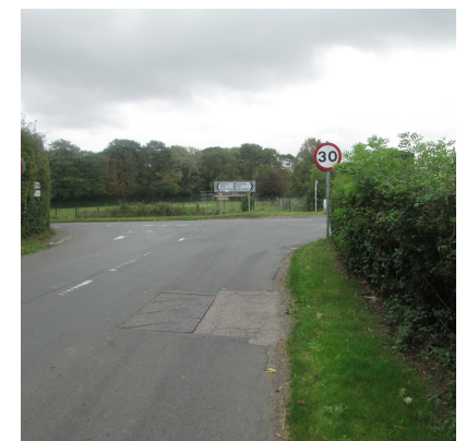
6. Cross over the Ashford Road