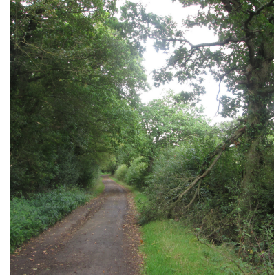
1. The lane turns into a byeway

www.elitepubs.com/venue/the-pig-and-sty/ hello@thepigandsty.com 01233 528 144