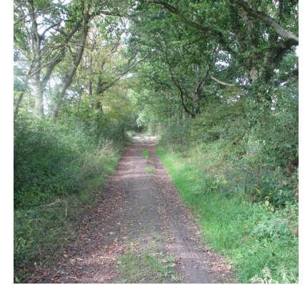
2. The trees along the byeway