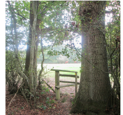
4. The footpath into the fields