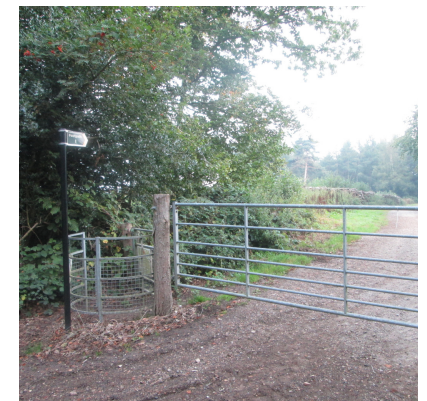
6. The gate back to the road