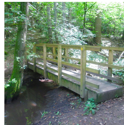
5. The bridge over the brook