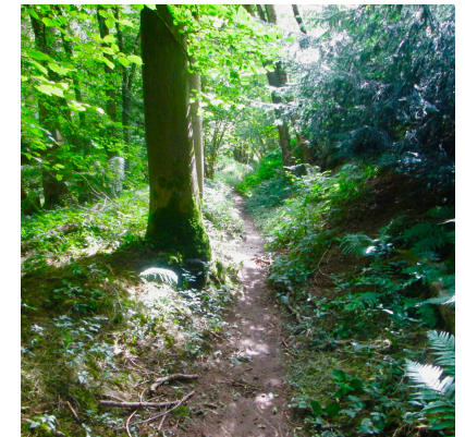
4. The footpath to the brook