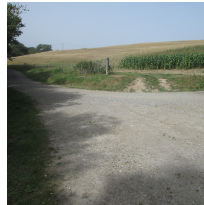
3. The track cross roads