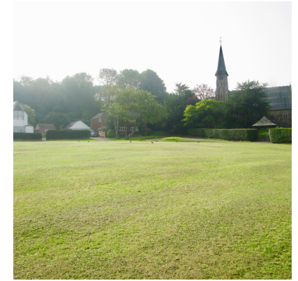
2. St Mary's Church