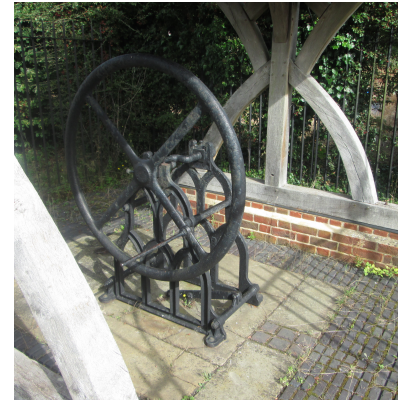
1. Old pump house

www.elitepubs.com/venue/the-pheasant-plucker/ hello@thepheasantpluckeridehill.co.uk 01732 902 300