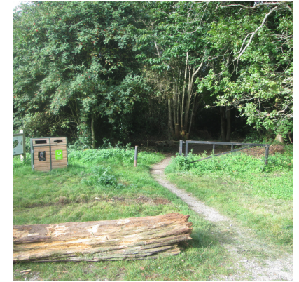
2. The Greensand Way