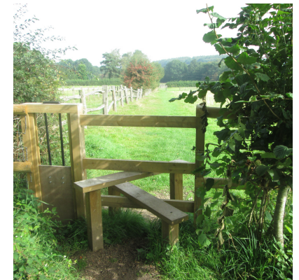
6. The stile back to the road