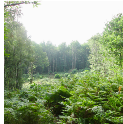
3. View along Greensand Way