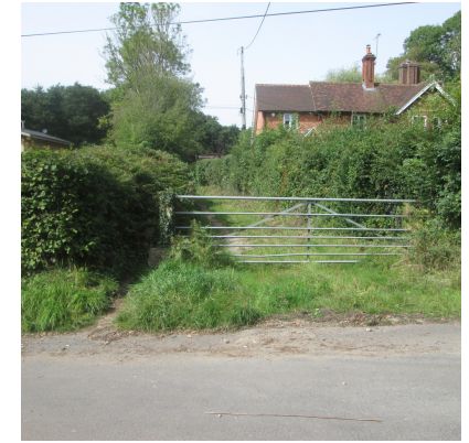
2. Opposite Brook Place