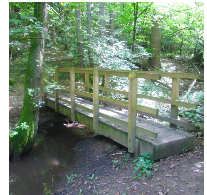
6. The bridge over the brook