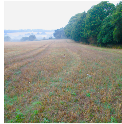
1. View to Brook Place

www.elitepubs.com/venue/the-pheasant-plucker/ hello@thepheasantpluckeridehill.co.uk 01732 902 300