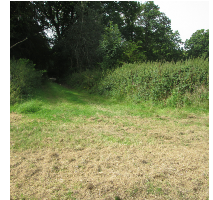
4. Penn Lane