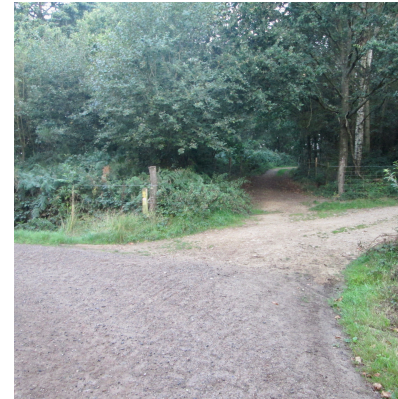
3. The path to Willow Wood