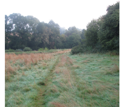
4. The field to Manor Farm