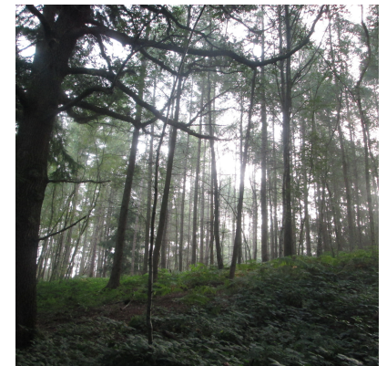
6. Through Hawk's Wood