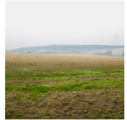
2. Views to the South West