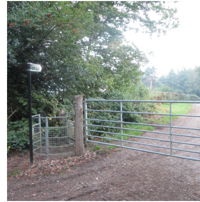
1. The first gate

www.elitepubs.com/venue/the-pheasant-plucker/ hello@thepheasantpluckeridehill.co.uk 01732 902 300