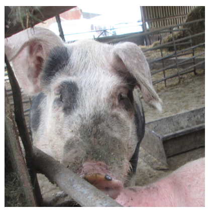
5. Renhurst farms