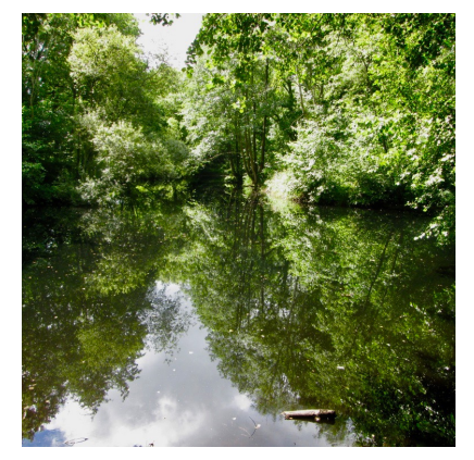
6. The carp lake