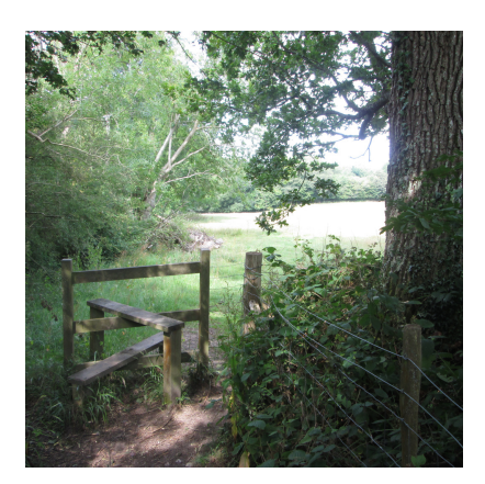
I. The stile after the steps