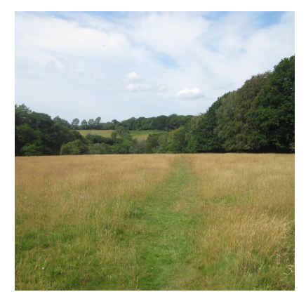
2. The field to the woods