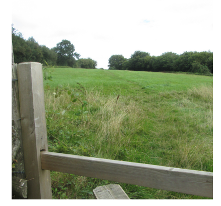
4. Grove Wood footpath