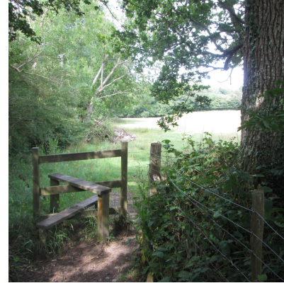
1. The stile after the steps

www.elitepubs.com/venue/the-lazy-fox hello@thelazyfox.net 01323 690050