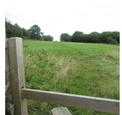
4. Grove Wood footpath