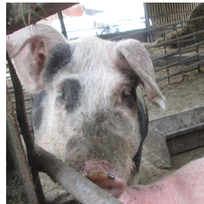
5. Renhurst farms