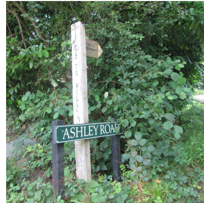
3. Ashley Road