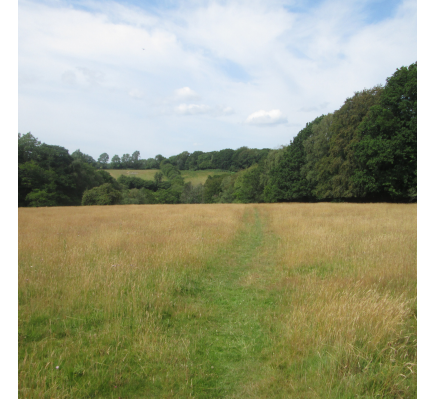
2. The field to the woods