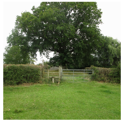
6. The final stile