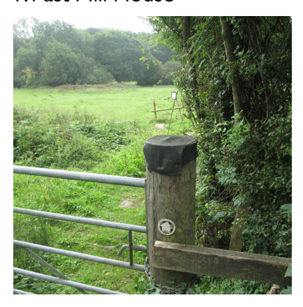
3. Over the stile to the woods