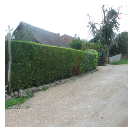
I. Past Mill House