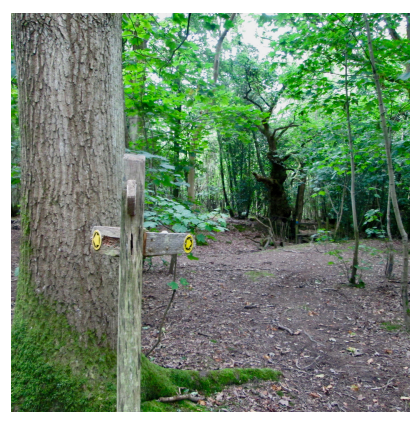
4. Footpath signpost