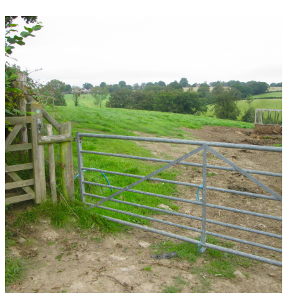
5. The farm gate and water trough