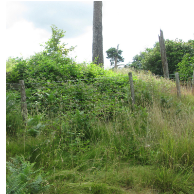
3. The old ice pit for the manor