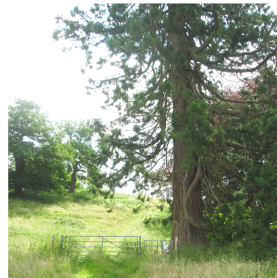
5. The gate from the ponds