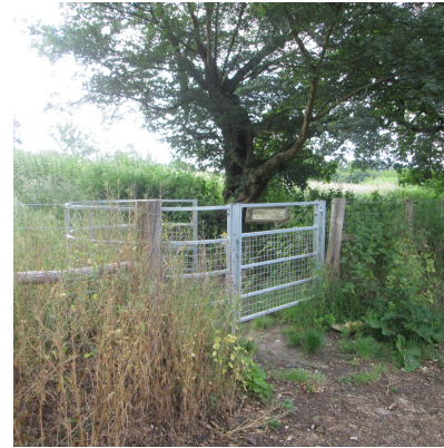
1. The gates to the ponds