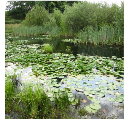
2. The ponds once used for ice