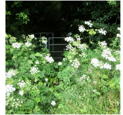
2. View across the Manor park