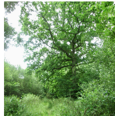
5. The stile by the iron gate