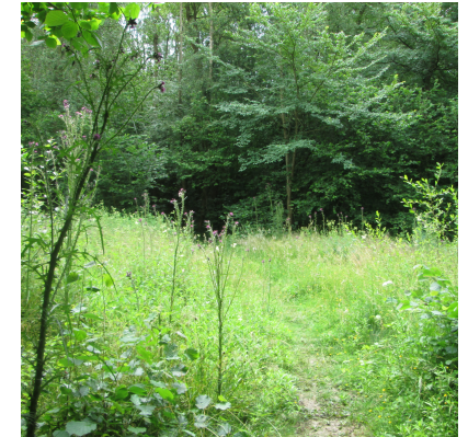
4. The grove of Oaks