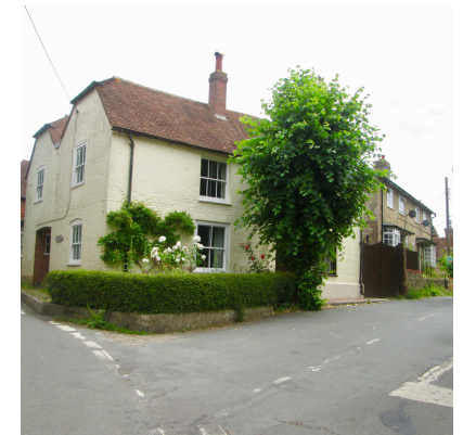
6. The Copper Beech on the heath