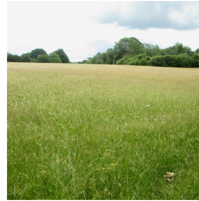
1. Turning right to Boughton Road

www.elitepubs.com/venue/the-wishful-thinker hello@thewishfulthinker.co.uk | 01622 232272