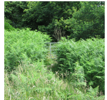
6. The heath path to the gate