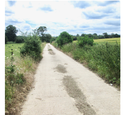
4. The road from the water works