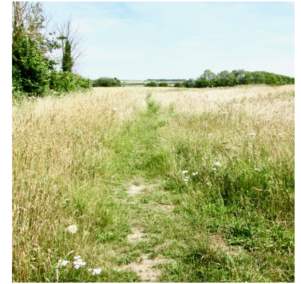
2. The path towards the downs