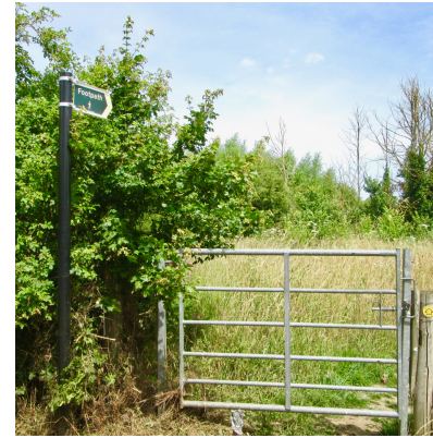
1. The gate off the road

www.elitepubs.com/venue/the-wishful-thinker hello@thewishfulthinker.co.uk | 01622 232272