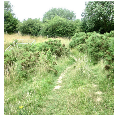
5. Heathland foot path