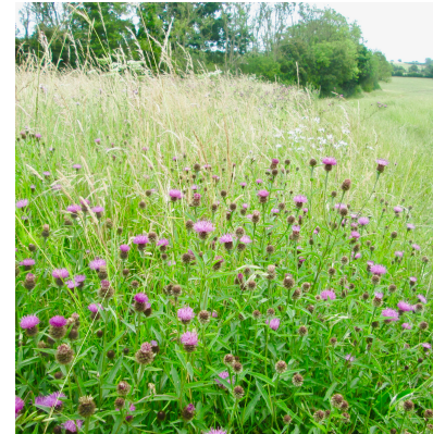
3. The top of the field