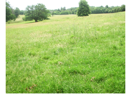
2. View across the Manor park