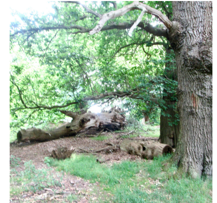
4. The grove of Oaks