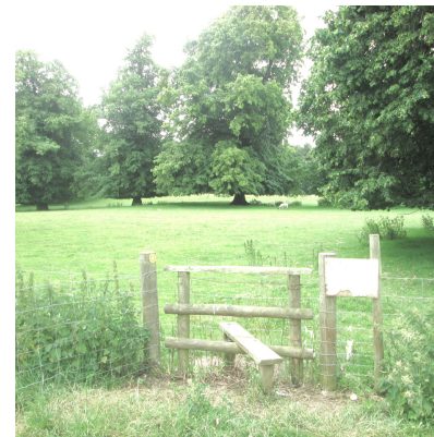
5. The stile by the iron gate