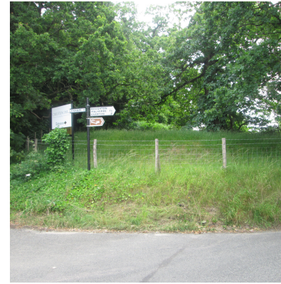
1. Turning right to Boughton Road

www.elitepubs.com/venue/the-wishful-thinker helo@thewishfulthinker.co.uk | 01622 232272