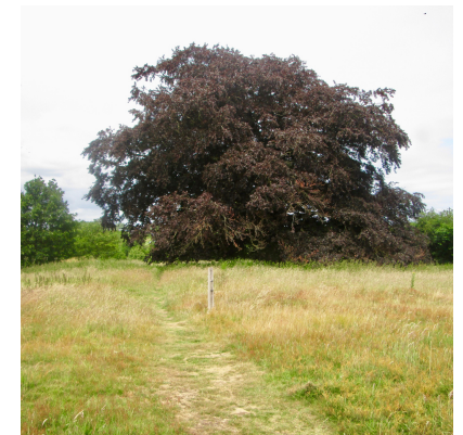
6. The Copper Beech on the heath