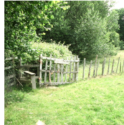
3. The stile over the fence