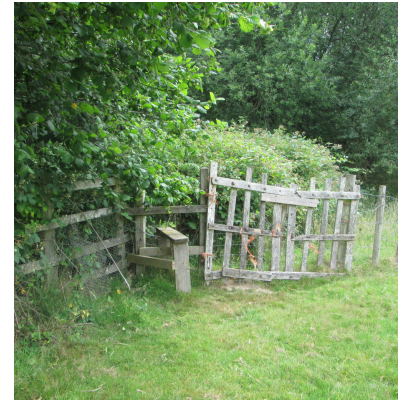
1. The stile in the first field

www.elitepubs.com/venue/the-wishful-thinker hello@thewishfulthinker.co.uk | 01622 232272