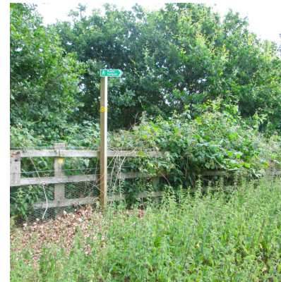
3. Pointing to the old Manor road