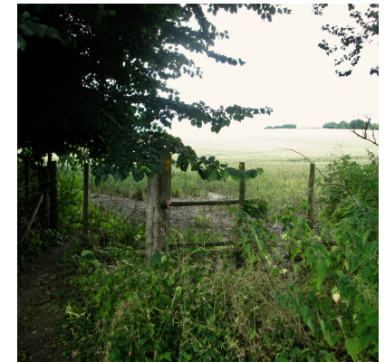
4. The stile by Popes Hall