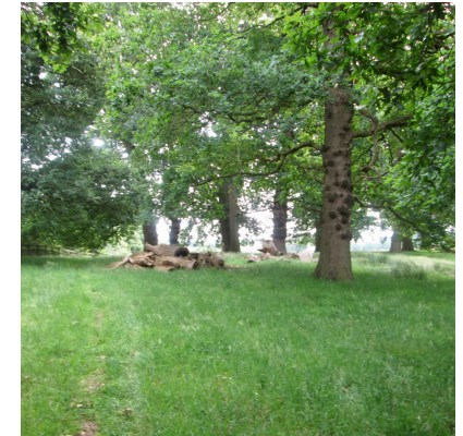
2. The grove of Oaks