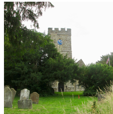
5. St Nicholas Church Malherbe