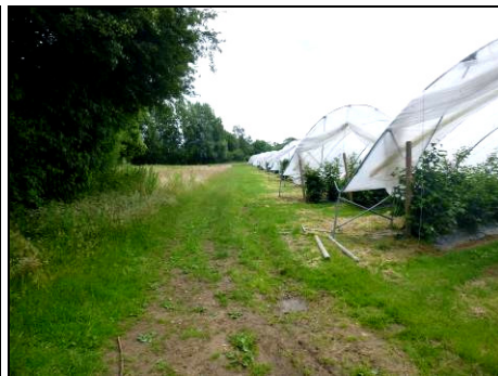
Pic 2: The footpath along the plant shelters in the farm