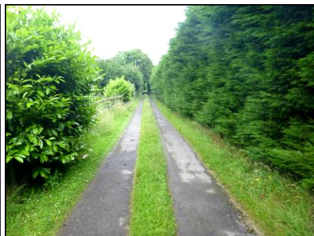
Pic 4: The driveway to one of the farmhouses