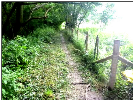
Pic 1: The footpath along the field