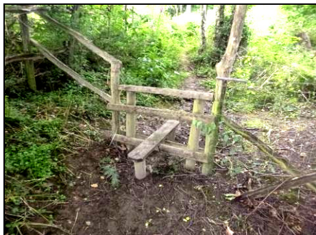
Pic 5: The stile in the middle of the woods