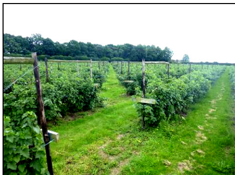
Pic 3: The footpath through the farm