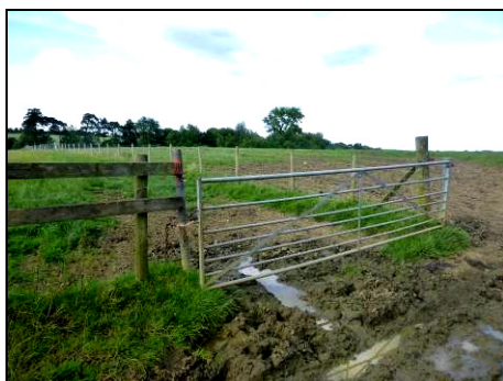
Pic 4: One of the metal gates on the Pleasant farm property