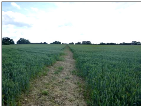
Pic 1: Public footpath through the field