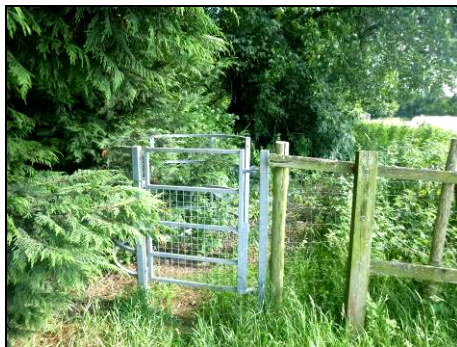
Pic 2: The metal gate next to a property