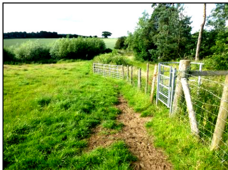
Pic 5: The metal gate leading to Langley Loch