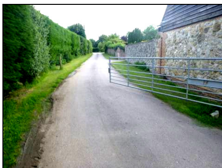
Pic 3: The entrance gate into Pleasant farm