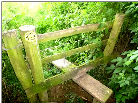
Pic 6: The stile leading into the last field