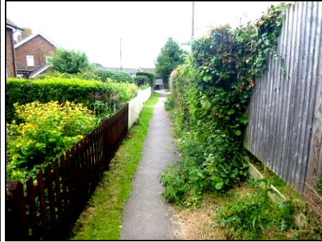
Pic 1: The crossroad of Horseshoes Lane and Lacey Close Pic 2: The pavement between the houses