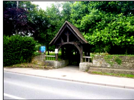
Pic 5: The footpath through the bushes Pic 6: The entrance gate of the church of Saint Mary