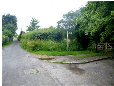
Pic 3: The Heath Road crossroad with Langley village sign Pic 4: The 'Public footpath' signpost where the footpath leaves Green Lane