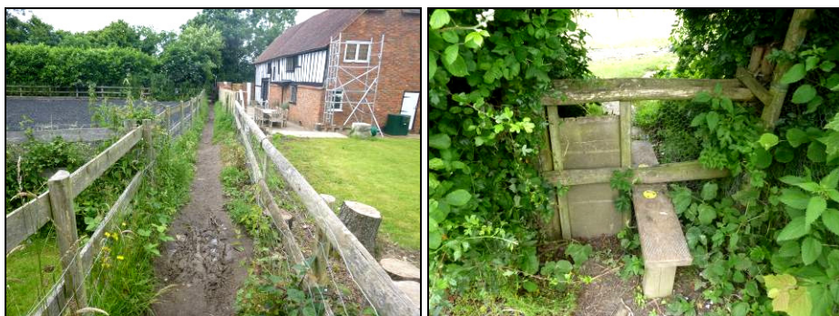
Pic 3: The footpath between the fences