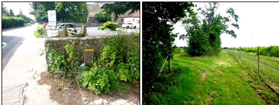
Pic 1: The 'Public footpath' stone before the church of Saint Mary