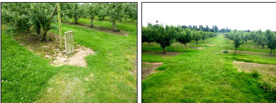
Pic 5: The 'Public footpath' stone in the middle of the orchard