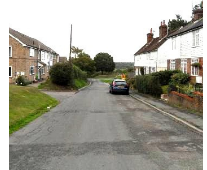
2. Hearten Oak Road