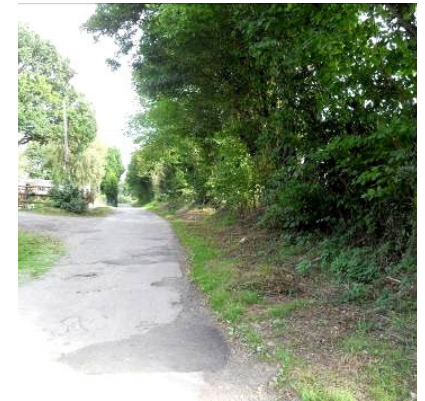
4. The lane