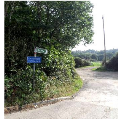
1. The turning onto the byway

www.elitepubs.com/venue/the-great-house eventstribes@elitepubs.com 01580 753119