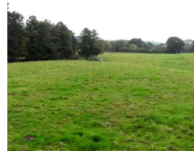
5. The field with the tees