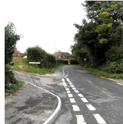
3. Basden Cottages on the left