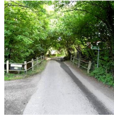
1. The turning to the bridleway

www.elitepubs.com/venue/the-great-house eventstribes@elitepubs.com 01580 753119