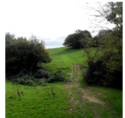
6. The rural road