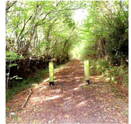
2. The two posts