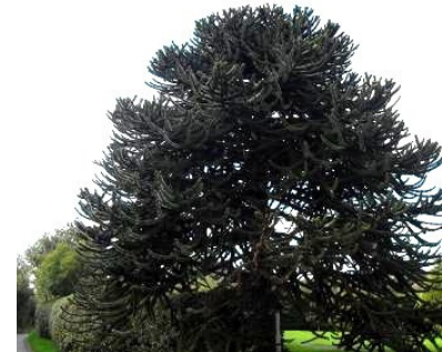
3. Monkey Tree