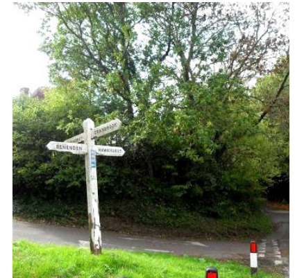
4. The Four Wents signpost