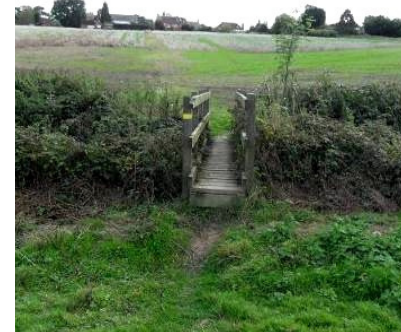
3. The bridge in the fields