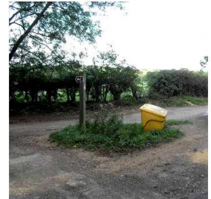
4. The bridleway