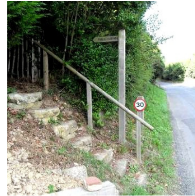
1. The turning to the footpath

www.elitepubs.com/venue/the-great-house eventstribes@elitepubs.com 01580 753119