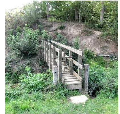
2. The footbridge in the valley