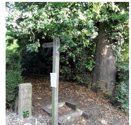
6. The public footpath