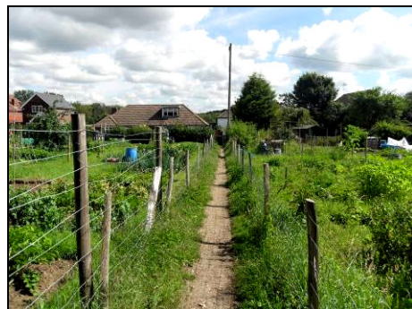
Pic 3: Public footpath in between the buildings