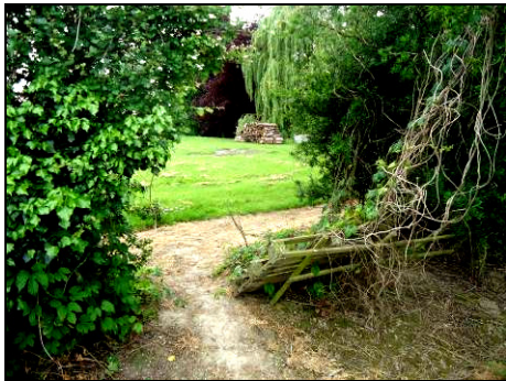
Pic 3: The passage through the hedges