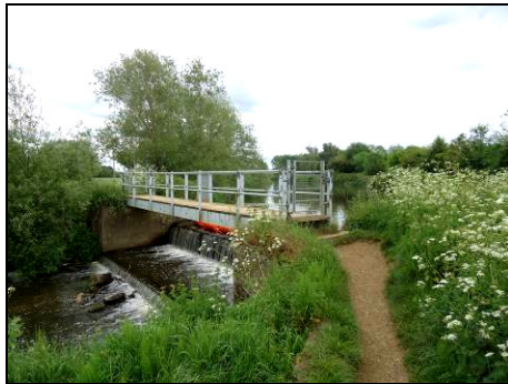
Pic 4: The footbridge close to Eldridge's lock