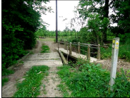
Pic 2: The small bridge over a stream