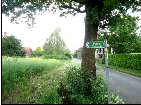
Pic 1: The 'Public Footpath' signpost