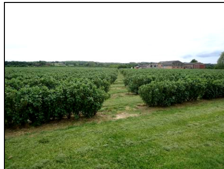
Pic 6: The footpath through the field of shrubs