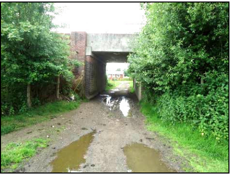
Pic 1: The footbridge between the fields