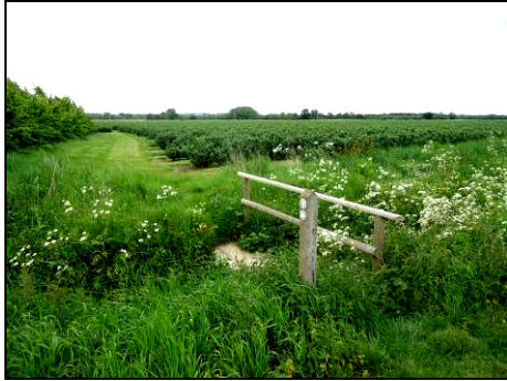
Pic 1: The footbridge leading into the field of shrubs