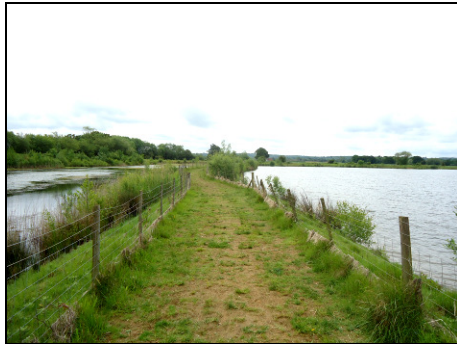
Pic 4: The footpath between lakes