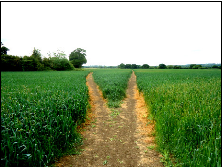
Pic 5: The fork crossroad in the middle of the field – GO RIGHT