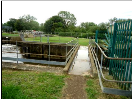
Pic 3: One of the bridges at East Lock