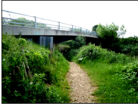
Pic 2: The concrete road bridge over the River Medway