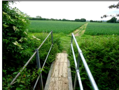
Pic 6: One of the footbridges between the fields