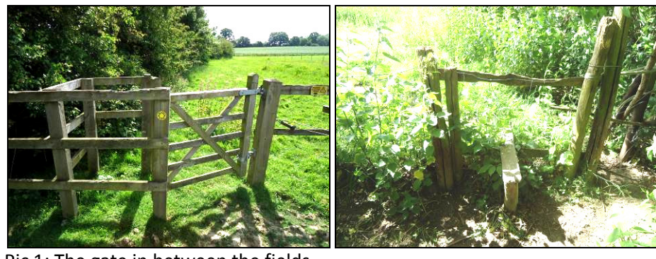
Pic 1: The gate in between the fields Pic 2: The stile leading into the field