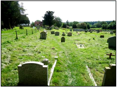
Pic 3: The footpath in the field Pic 4: The cemetery around The Capel