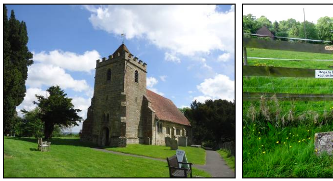
Pic 5: The Capel Pic 6: The stile at Bank Farm