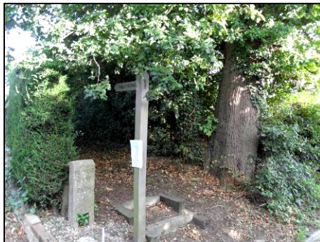
Pic 6: The 'Public Footpath' signpost and several steps