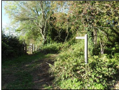
Pic 1: The turning onto the Public footpath