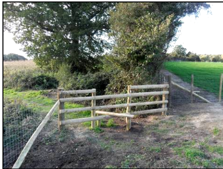
Pic 4: The stile in between fields