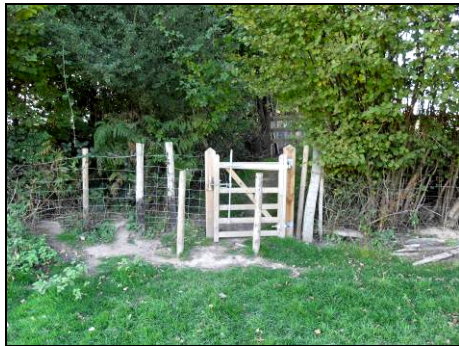
Pic 3: The gate in between fields