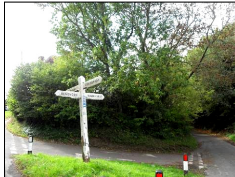
Pic 4: The 'Four Wents' signpost