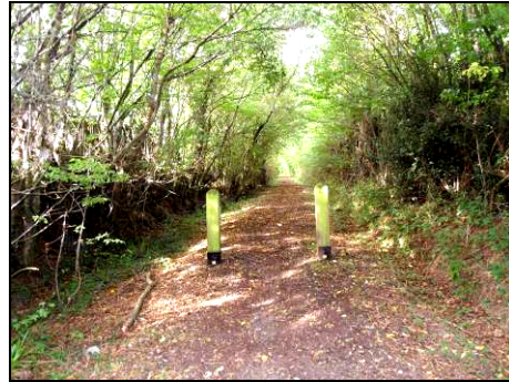
Pic 1 and Pic 2: The turning onto the Public bridleway and two posts you pass