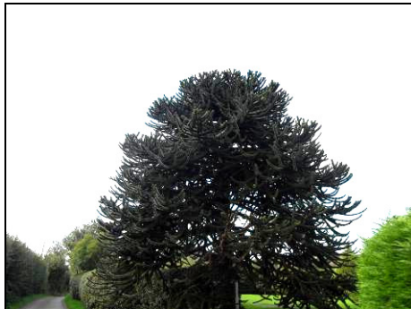
Pic 3: Monkey tree