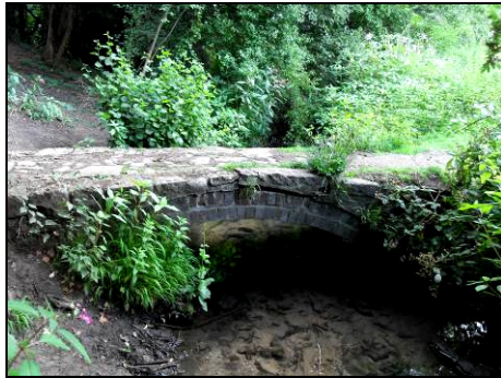
Pic 1: A small footbridge over a stream