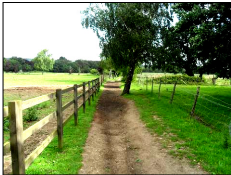
Pic 3: The track through the paddocks