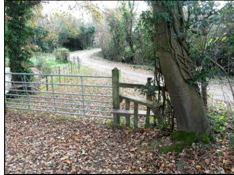
Pic 2: The stile in between the field and the track