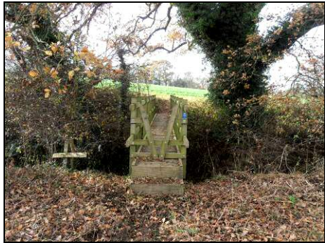
Pic 3: The wooden footbridge