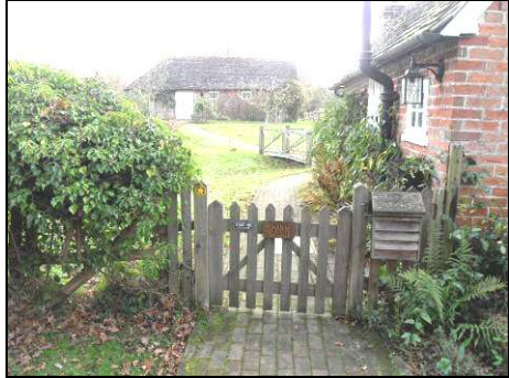
Pic 1: The wooden gate into the farm