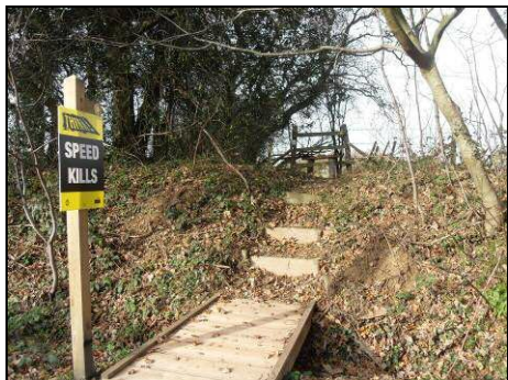
Pic 5: The small footbridge, several steps and the style