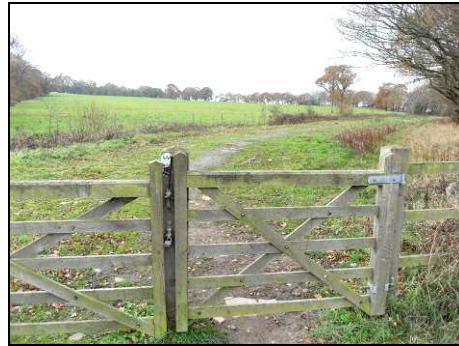
Pic 4: The wooden gate onto the bridleway