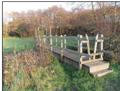
Pic 6: The small footbridge on the Wealdenway