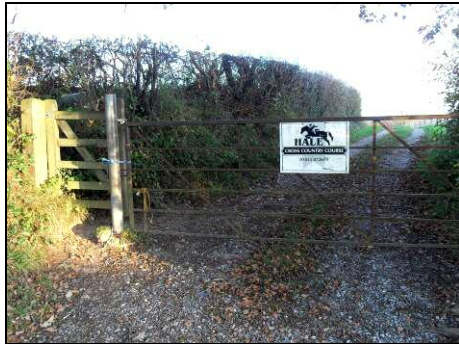
Pic 3: The wooden and metal gates