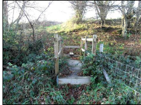
Pic 2: The wooden footbridge