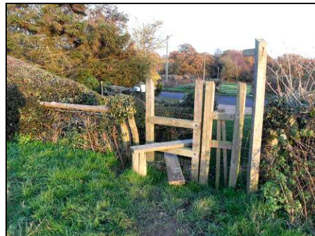
Pic 6: Style in between the field and the road