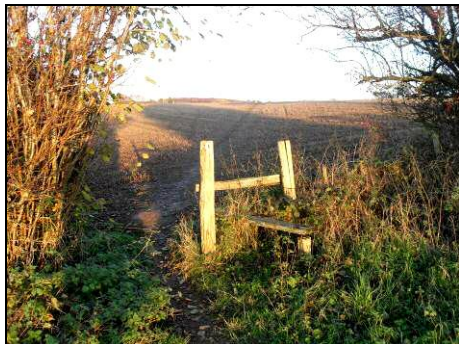
Pic 5: Style in between the fields