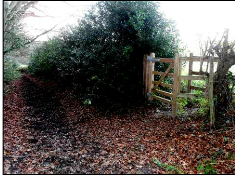
Pic 1: Wooden gate into the field