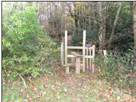
Pic 2: Style between the track and the field